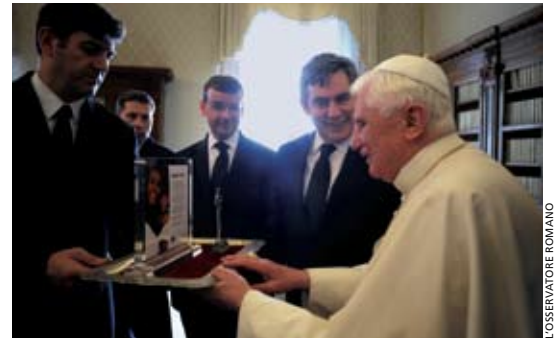
Pope Benedict XVI receives the IFFIm gift from British Prime Minister Gordon Brown

Baby Brucktayet had just received a pentavalent vaccination against diphtheria, pertussis, tetanus, Hepatitis B and Haemophilus influenzae type B or Hib provided by the GAVI Alliance using funds raised by IFFIm.