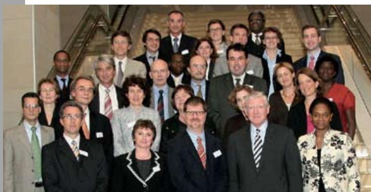
IFFIm donors, board members and GAVI staff at the IFFIm donors meeting in Cape Town, South Africa on 27 November 2007