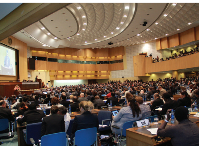
Third International Conference on Financing for Development