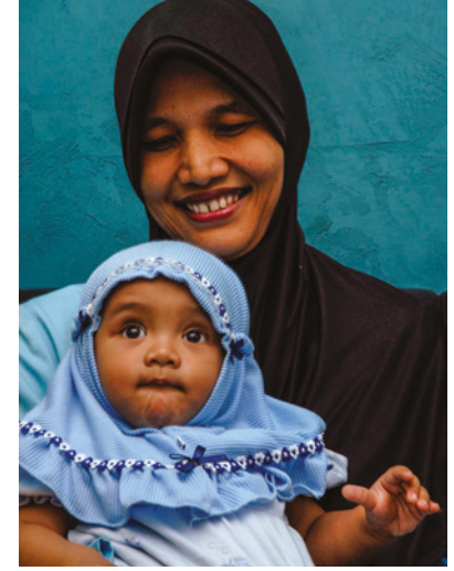
A mother and child sit together during Gavi's 2007 hepatitis B introduction in Indonesia.

This successful transaction became the largest Sukuk al-Murabaha issuance in the public markets and the largest inaugural sukuk offering from a Supranational.