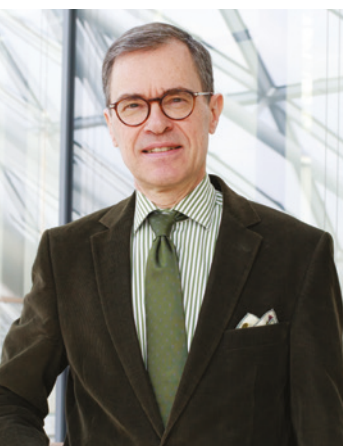
European Investment Bank